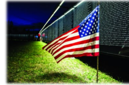
Vietnam Veterans Memorial

The Collier County Clerk's Office joins all Americans to reflect on the sacrifices and service of the men and women who died while serving in the United States Armed Forces.